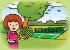
a tennis player