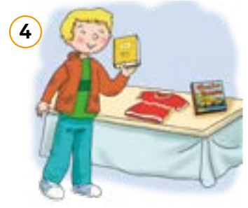
pick a prize