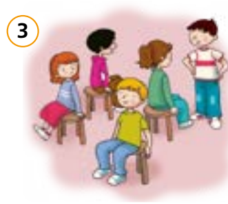
play musical chairs