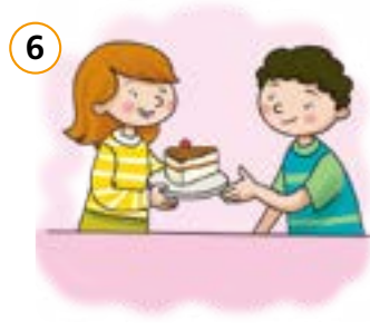
serve the cake