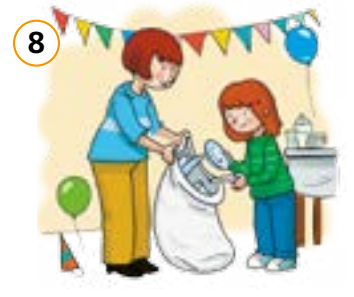
help clean up