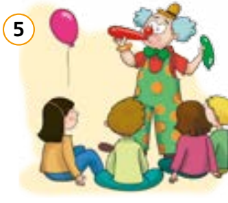
watch a clown