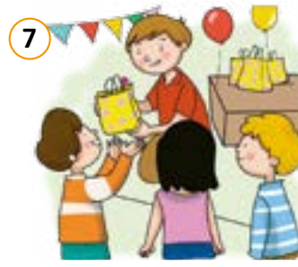
pass out party favors