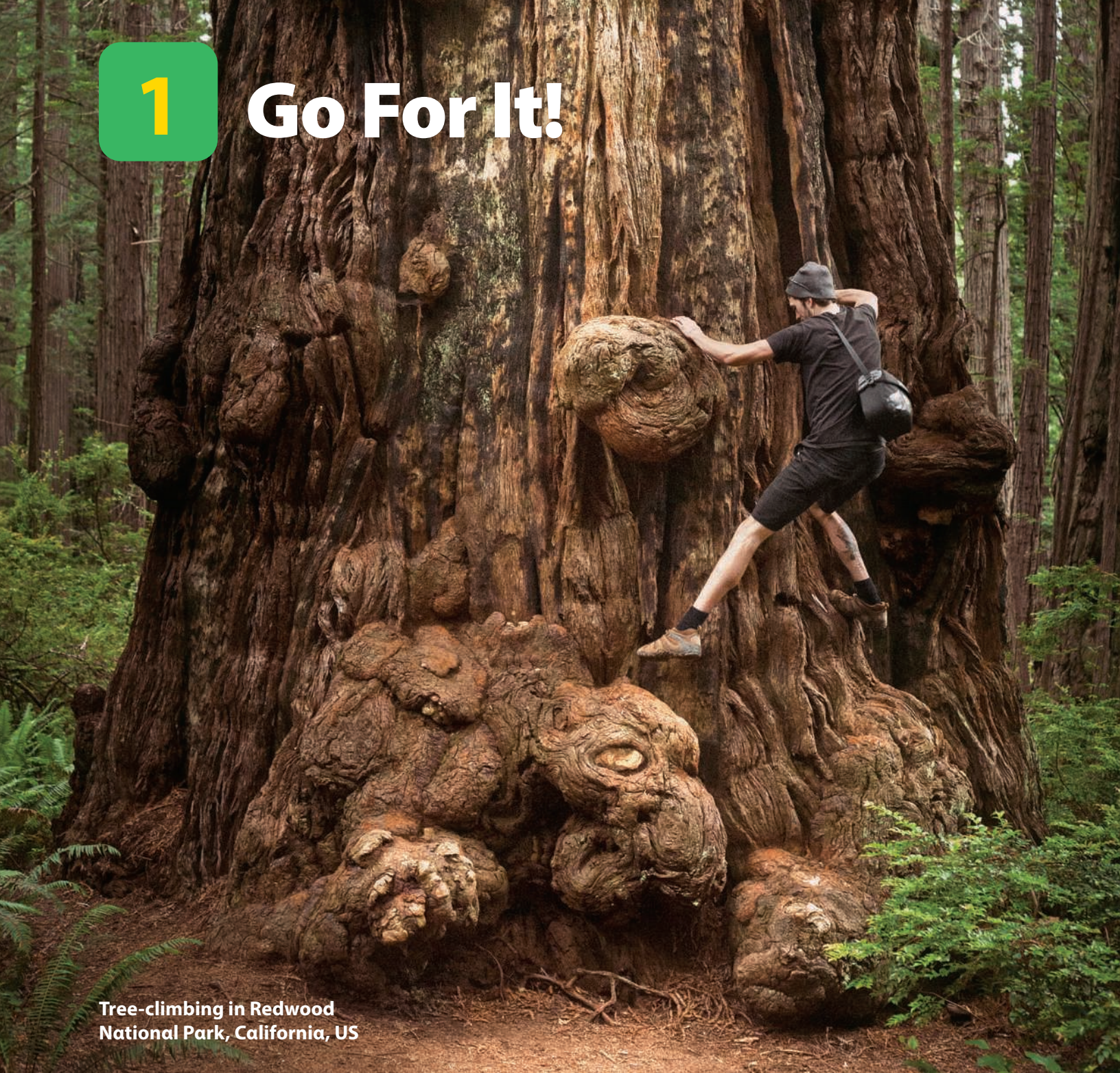
Tree-climbing in Redwood National Park, California, US

A Check (✓) the sentences you agree with. Compare with a partner.