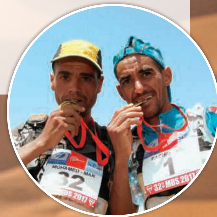
A runner in the Marathon des Sables, Morocco