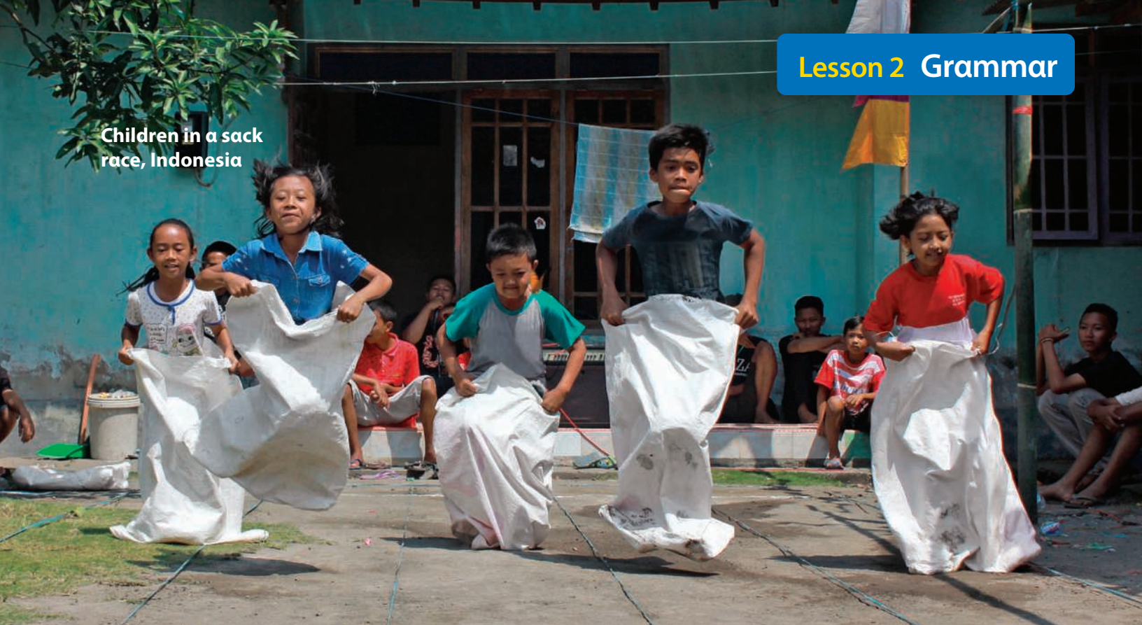
Children in a sack race, Indonesia

We use the past progressive to talk about past actions in progress. We often use it for describing a scene.